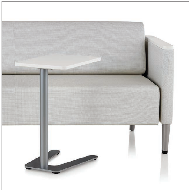
Mobile Table's base lets it fit under other pieces.