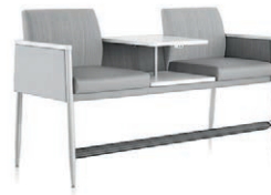
Easy Access Two Seat with Inner Table* pp. 5, 10