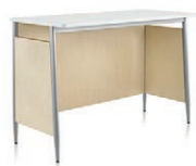
Two Place Daystand - 52** pp. 4, 9, 14