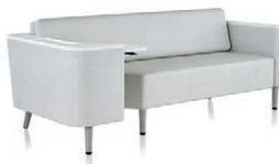
Flop Sofa with Utility Arm and Adjustable Table p. 7