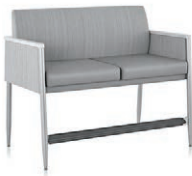
Easy Access Two Seat with Arms*