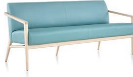
Sofa with Open Arms