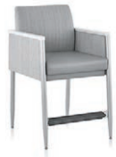
Easy Access Chair with Arms