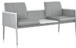
Two Seat with Center Table*