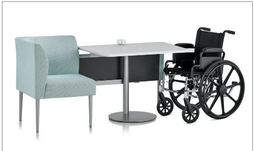
Single booths accommodate people in wheelchairs.