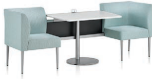
Two Seat Booth* pp. 3, 4