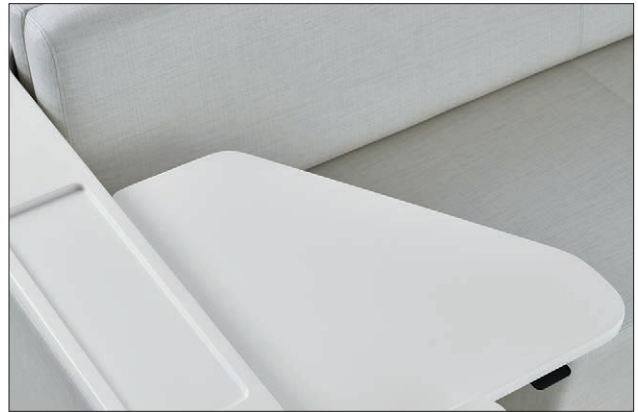
Flop® Sofa table adjusts to become a work surface.