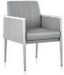
Single Chair with Arms