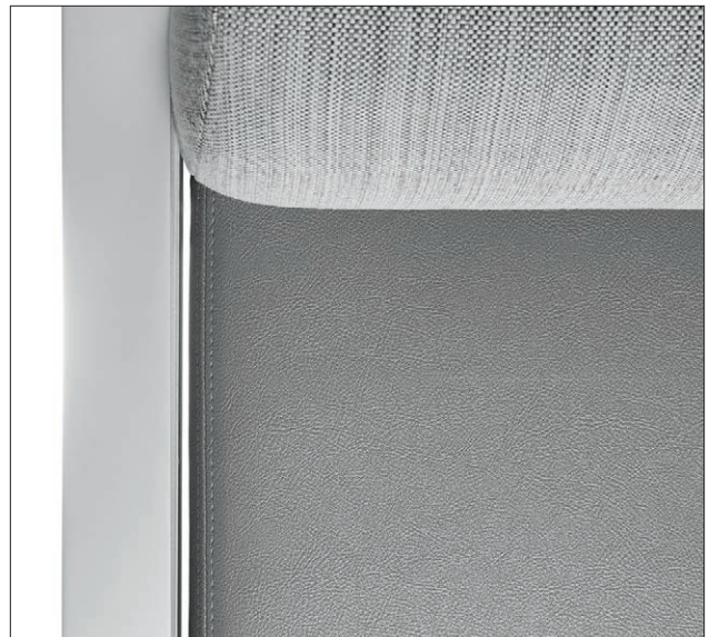
Wipe-out design allows for easy cleaning.