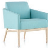
Chair with Upholstered Arms pp. 9, 14