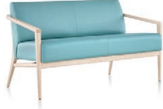
Settee with Open Arms