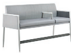
Easy Access Plus Chair with Right Single Chair and Intervening Arm* Also Available with Left Single Chair p. 10