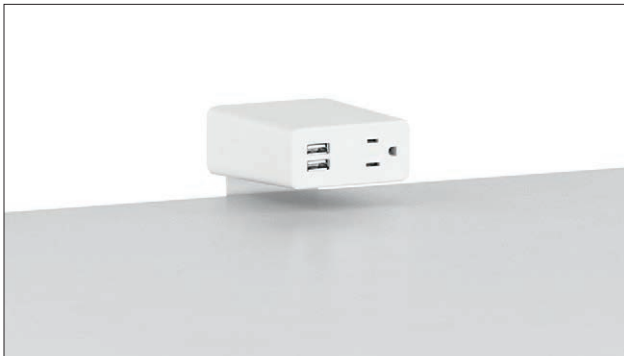
Integrated power access enables guests to stay connected.