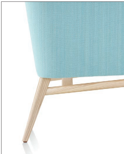
Wall-saver design protects both walls and upholstery.