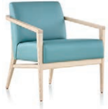
Chair with Open Arms pp. 2, 13, 15