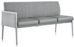
Three Seat with Left Arm* Also available with Right Arm p. 9