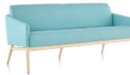
Sofa with Upholstered Arms pp. 12, 15