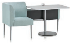
Single Booth (LSF)* Also available in RSF p. 11