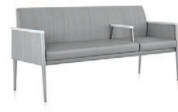
Plus Chair with Right Single Chair and Intervening Arm* Also available with Left Single Chair