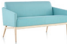
Settee with Upholstered Arms pp. 2, 12, 14