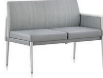
Two Seat with Right Arm* Also available with Left Arm pp. 2, 4, 9, 11